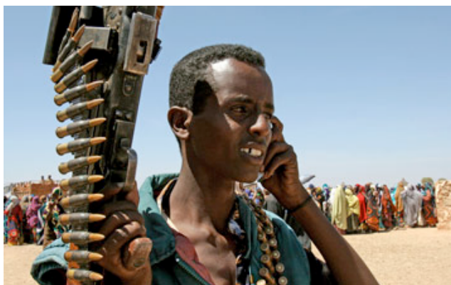
What, no network?

HOW did a device that just a few years ago was regarded as a yuppie plaything become, in the words of Jeffrey Sachs, a development guru at Columbia University's Earth Institute, "the single most transformative tool for development"? A number of things came together to make mobile phones more accessible to poorer people and trigger the rapid growth of the past few years. The spread of mobile phones in the developed world, together with the emergence of two main technology standards, led to economies of scale in both network equipment and handsets. Lower prices brought mobile phones within reach of the wealthiest people in the developing world. That allowed the first mobile networks in developing countries to be set up, though prices were still high.